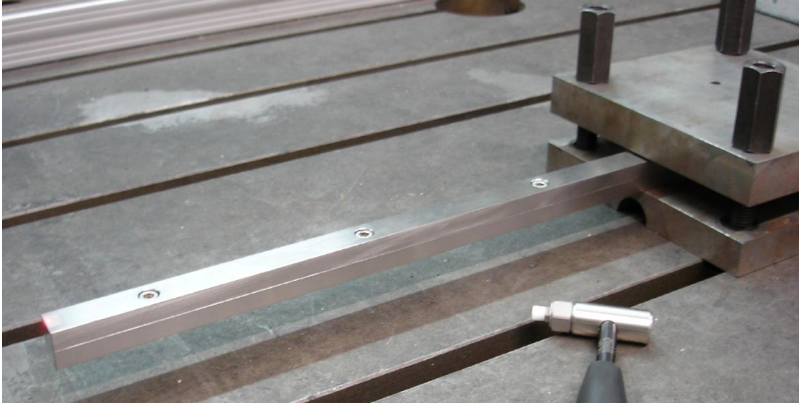
Figure 2: Experimental set-up.

The constitutive contact laws have been implemented as a user subroutine into the commercial finite element code Abaqus, where the normal contact behavior has been approximated by an exponential pressure-gap law and the tangential behavior by a multi-radial-return-mapping algorithm employing an Iwan series model with pressure dependent tangential stiffness at each integration point. The performance of this model is compared to experimental results from a double-beam set-up, as shown in Fig. 2. As shown in Fig. 3, the proposed microslip model captures the dissipation behavior quite well.